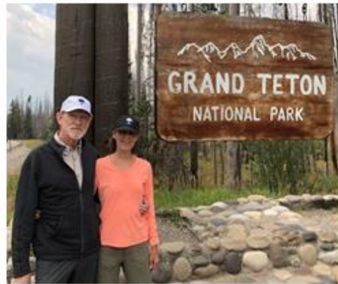
Our clients enjoyed wearing their LifeTime hats all around Yellowstone and the Grand Tetons last fall.

Need a LifeTime mask, flag, or mug? Just let our office know!