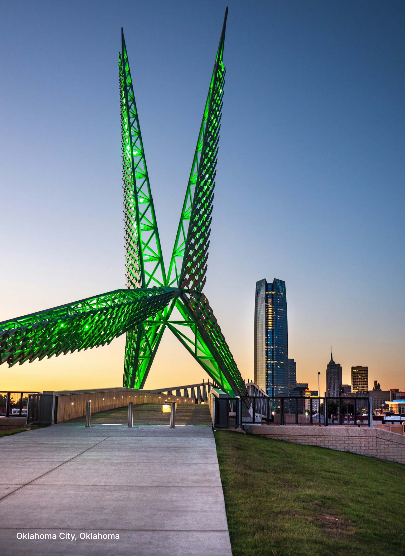
Oklahoma City, Oklahoma