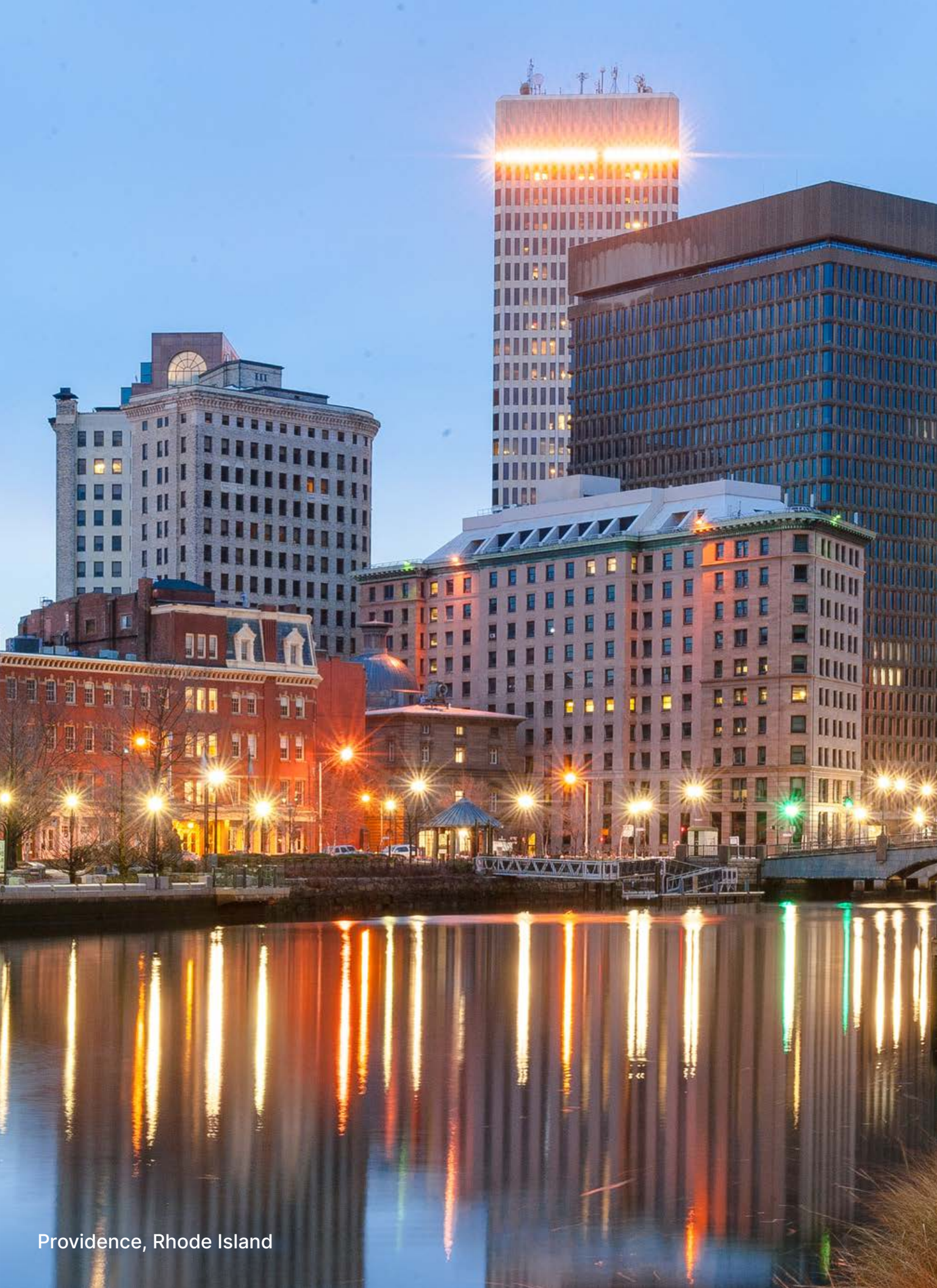
Providence, Rhode Island