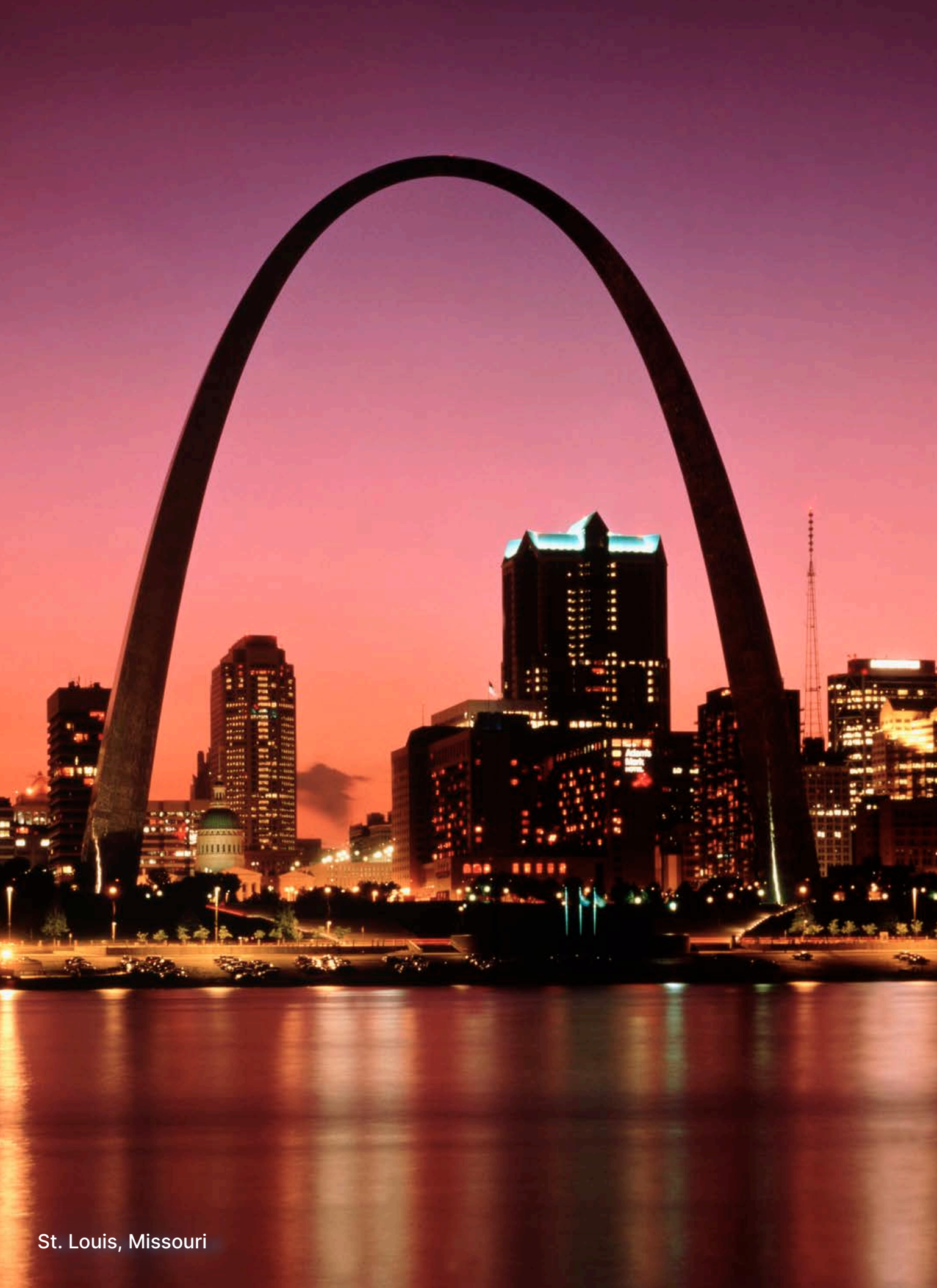
St. Louis, Missouri