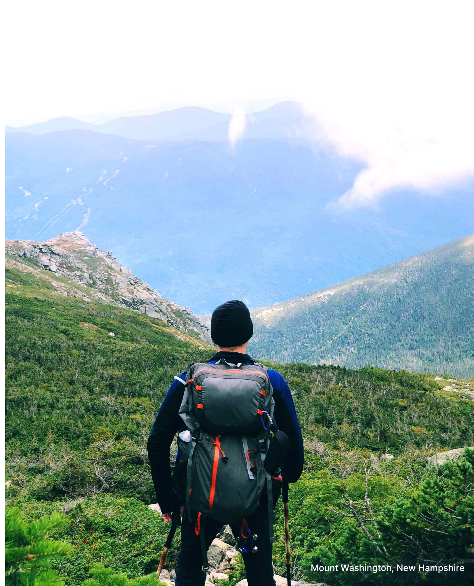
Mount Washington, New Hampshire