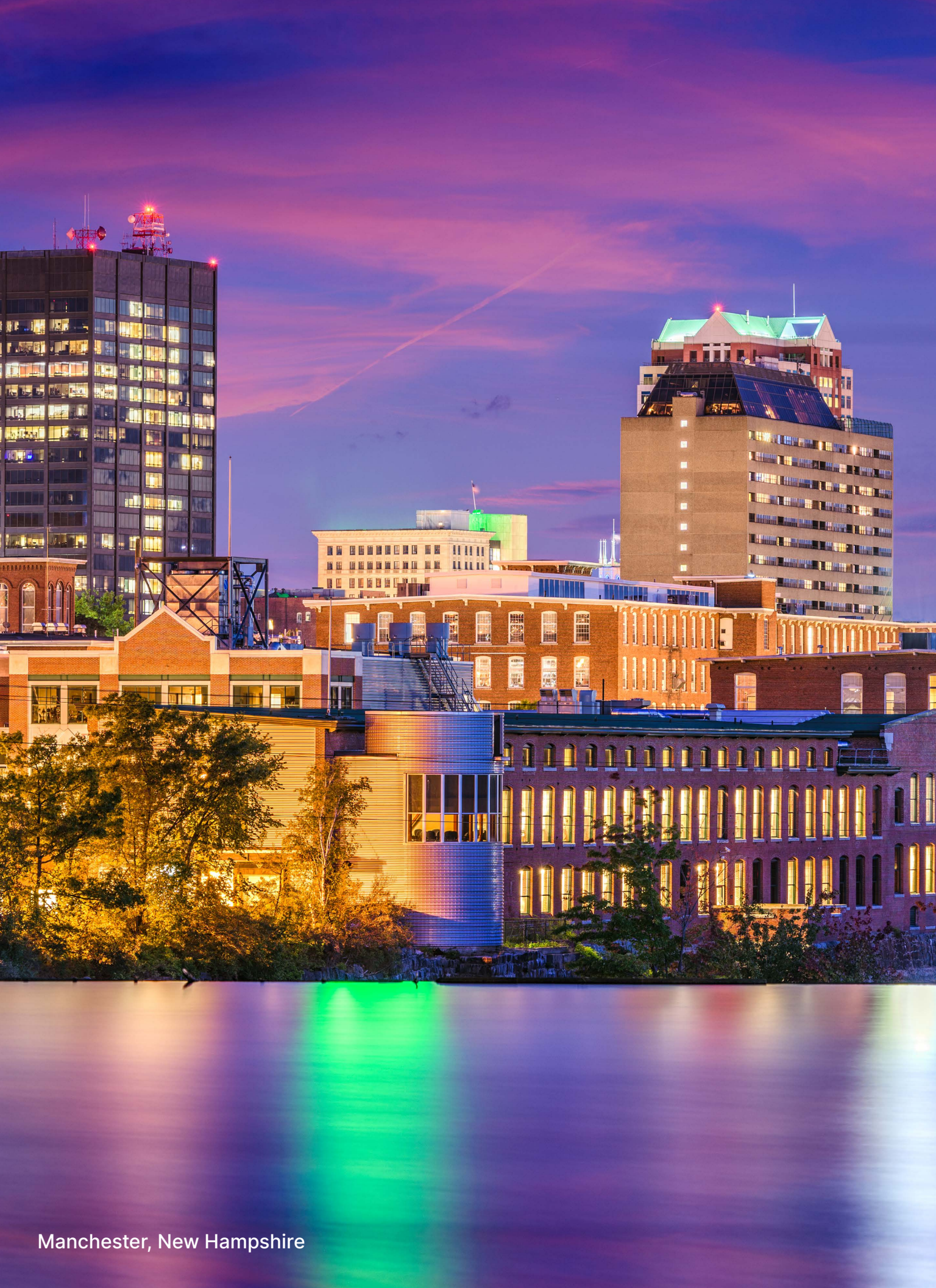
Manchester, New Hampshire