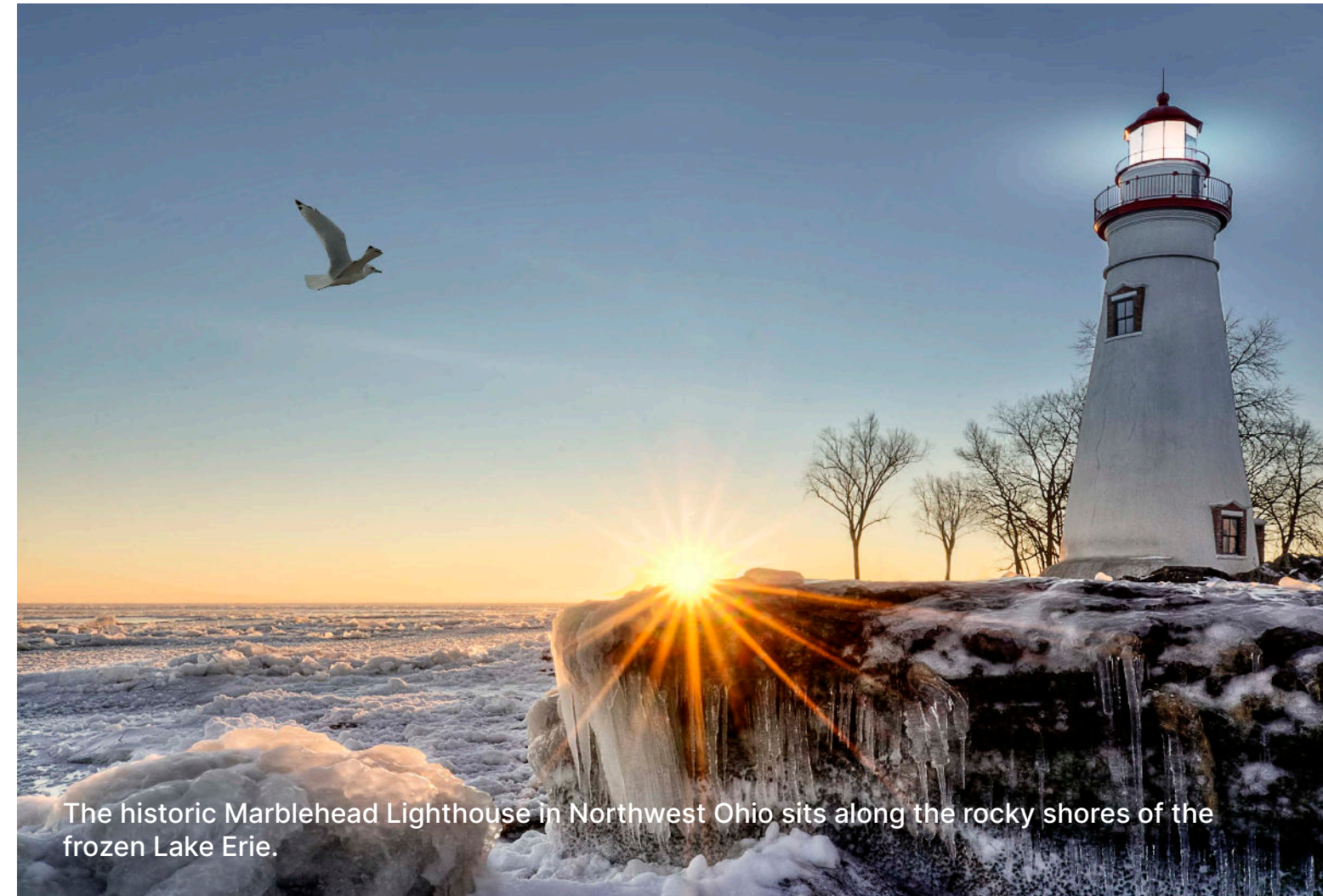
The historic Marblehead Lighthouse in Northwest Ohio sits along the rocky shores of the frozen Lake Erie.