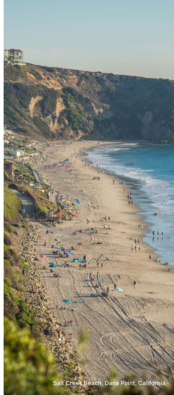
Salt Creek Beach, Dana Point, California

While March served as a reminder that risks can shift suddenly for markets, the long-term outlook remains solid due to the healthy fundamentals. Given the potential for further short-term disruptions, a well-diversified portfolio that matches investor goals and risk tolerance remains the best path forward for most. If concerns remain, you should speak with your financial advisor to go over your financial plans.